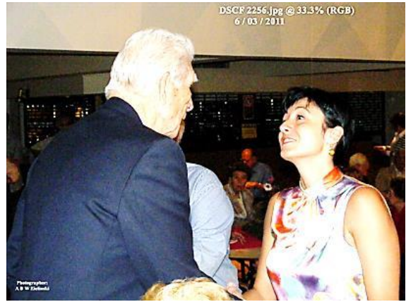
Celebracja jubileuszu 90-dziewięćdziesiątlatków w Klubie Polskim w Ashfield.