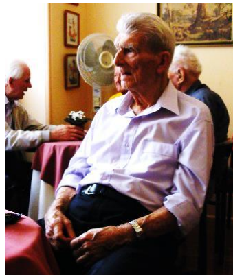
W dniu swoich 98 urodzin na zebraniu Zarządu Koła S.P.K – 4 Grudzień 2012